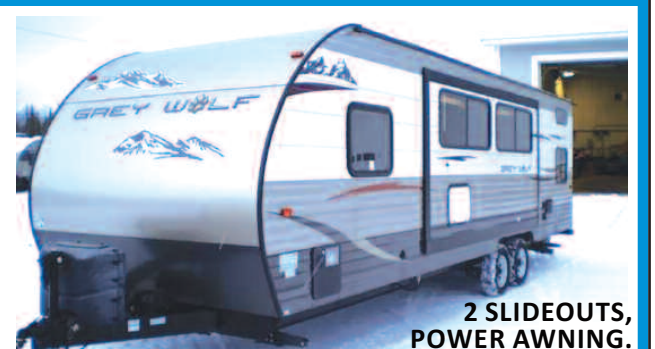
2 SLIDEOUTS, POWER AWNING.